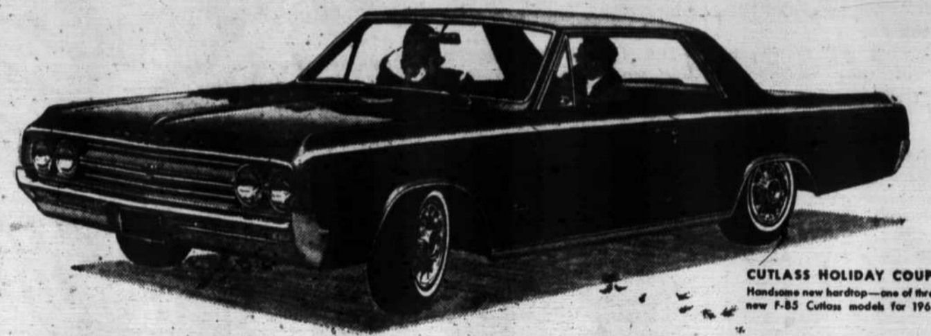
CUTLASS HOLIDAY COUPE Holds new hardtop—one of three new F-85 Cutlass models for 1964.

Jetstar 88 New full-size, lower-priced "88" series! Just out—the Jetstar 88 series! Companion to the Dynamic and Super 88, it introduces a brand new 330-cu.-in. Jetfire Rocket V-8. Four smart Jetstar 88s in all.